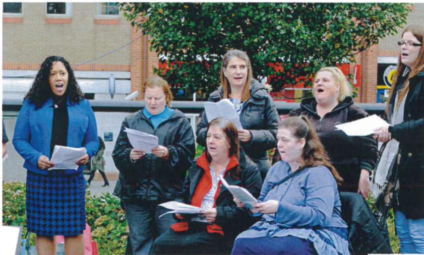
Greenwich Mind Choir performing for World Mental Health Day